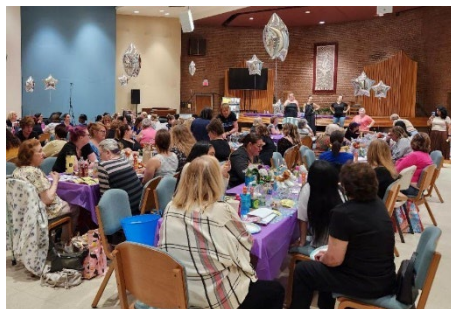
Ready to win at Pocketbook Bingo