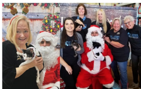
Pet photos with Santa