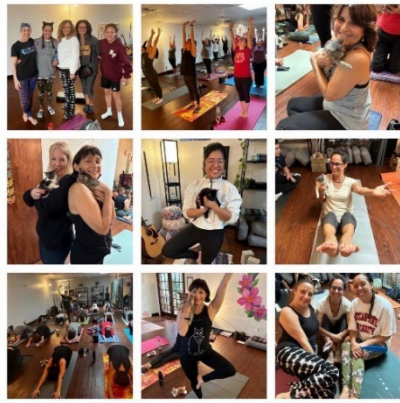
What's better than yoga? Yoga with kittens!