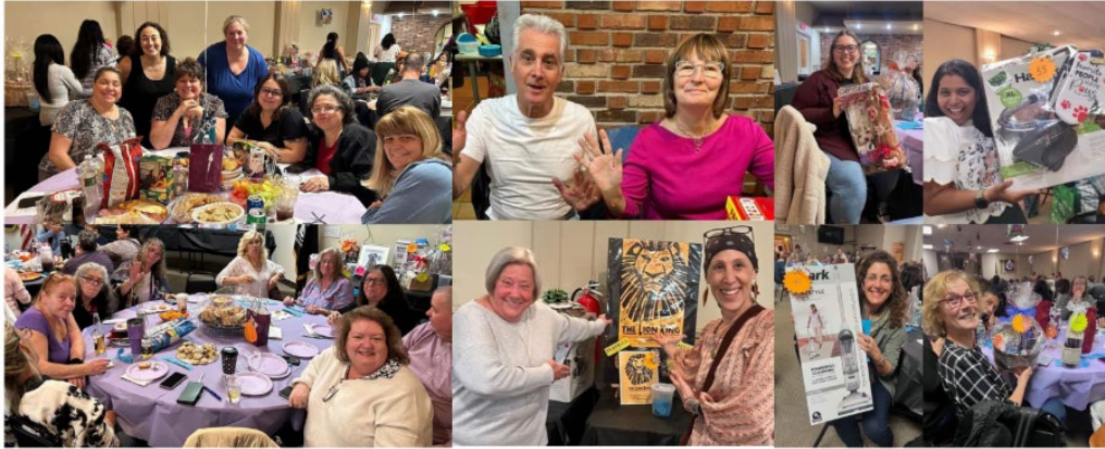
Lots of fun and prizes at this year's tricky tray

This year's events gave us a chance to raise funds for our animals, win great prizes, and have a great time!