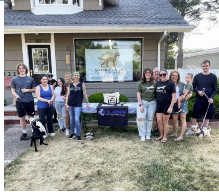
Adoption event with Maverick's K9 Mission & Dog Training

Thank you to everyone who participated in and supported our various fundraisers and events this year. We look forward to seeing you next year!