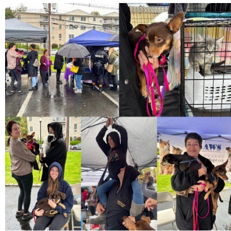
Braving the rain at Subaru Loves Pets