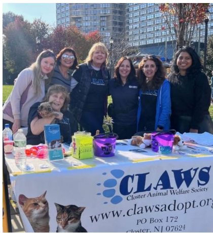
Howl-o-ween with Port Imperial Pooches