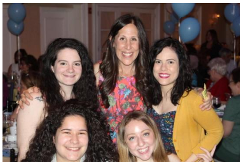
Ready to win big at our 8th annual tricky tray