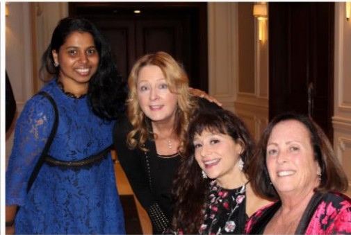
Our board, volunteers, and donors came together for our 50th Anniversary gala